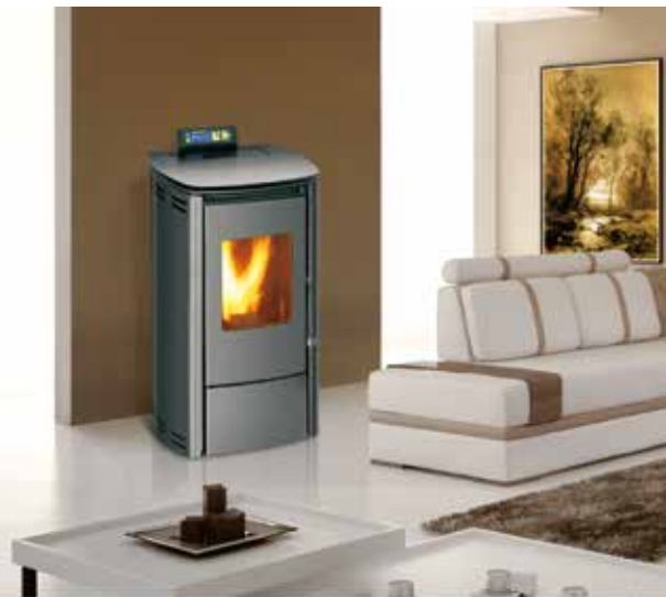
Midi 6kw, Midi 9kw, Maxi 12kw