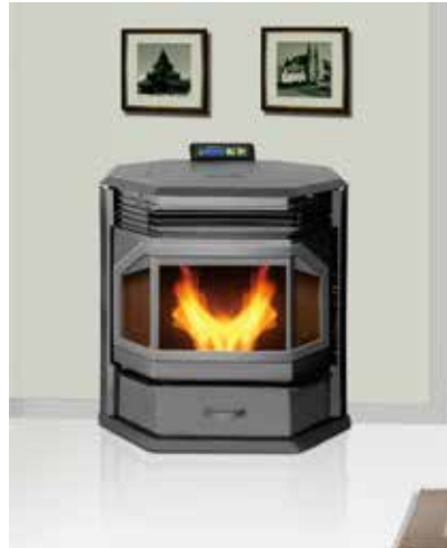
Freestanding - 8 & 13Kw