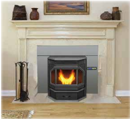
Fireplace - 13kw