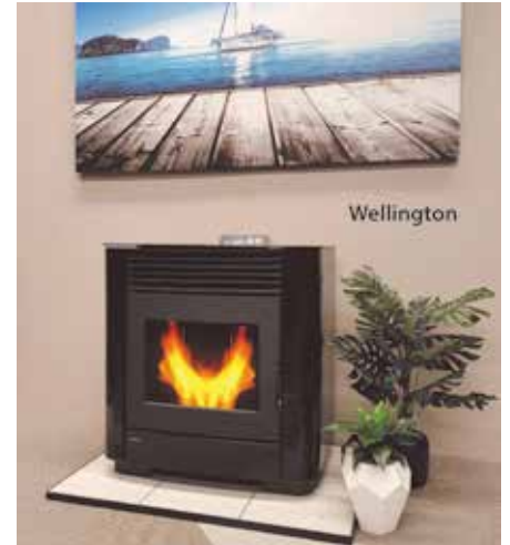
Wellington - 13kw